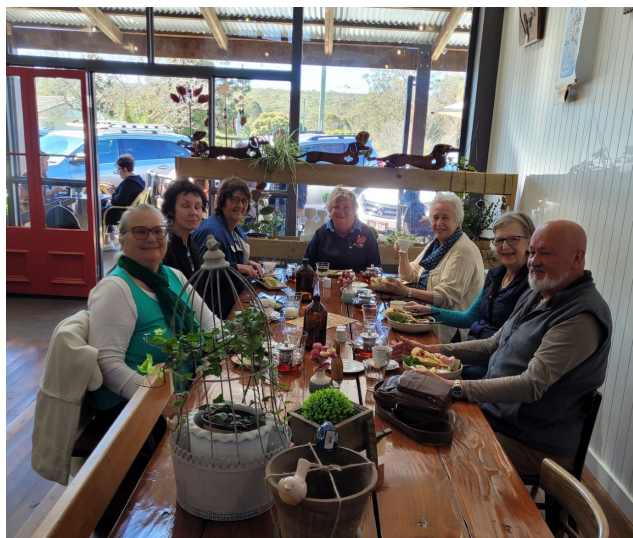
First Lunch Group at The Potager-Tea House, Crows Nest

This last term has flown by. We were encouraged to start a Lunch Group in Crows Nest, especially as there are so many new amazing eateries here, including four new ones which open Thursday - Sunday. Our Thursday Lunch group has so far sampled only two. Bring on Term 4 - lunch dates Oct. 13, Nov. 10 & 24.