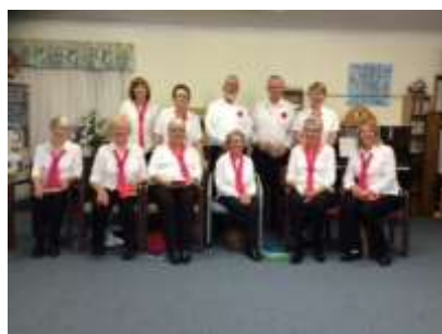
The new Pittsworth U3A Community Choir singing at Yallambee Nursing Home, Millmerran.

Membership in Pittsworth continues to grow and classes are popular. The new Community Choir is proving to be popular. Within the choir are several smaller groups which will take part in Dalby Eisteddfod this year. They have several engagements coming up so are quite busy. At the end of the year they have a concert and join with the Primary state School to sing songs from a musical. This year it is The Lion King .