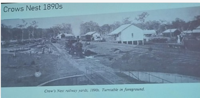
Crows Nest 1890s