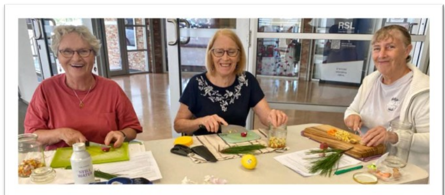
EATING FOR HEALTH AND NUTRITION FOR LIFE