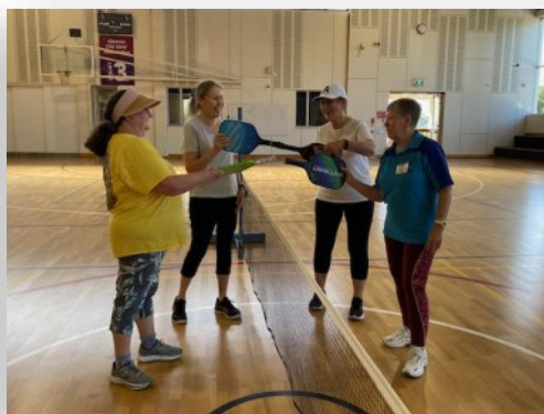
FINISHING ANOTHER PICKLEBALL GAME