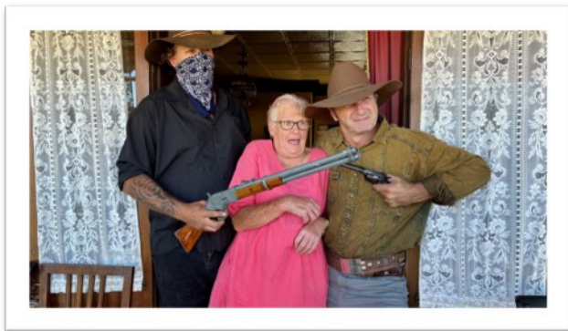
"HOLDUP" AT THE BULLS HEAD INN DRAYTON

An interesting lecture about our local Bushranger "Thunderbolt" and his exploits was well attended at the Bulls Head Inn Drayton