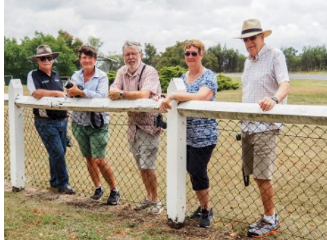
Yandilla Church and Cemetery