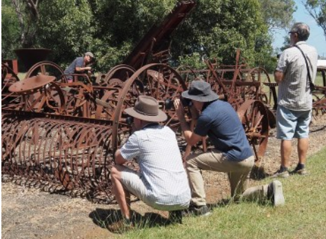
Practicing new found skills at the Pioneer Village Pittsworth